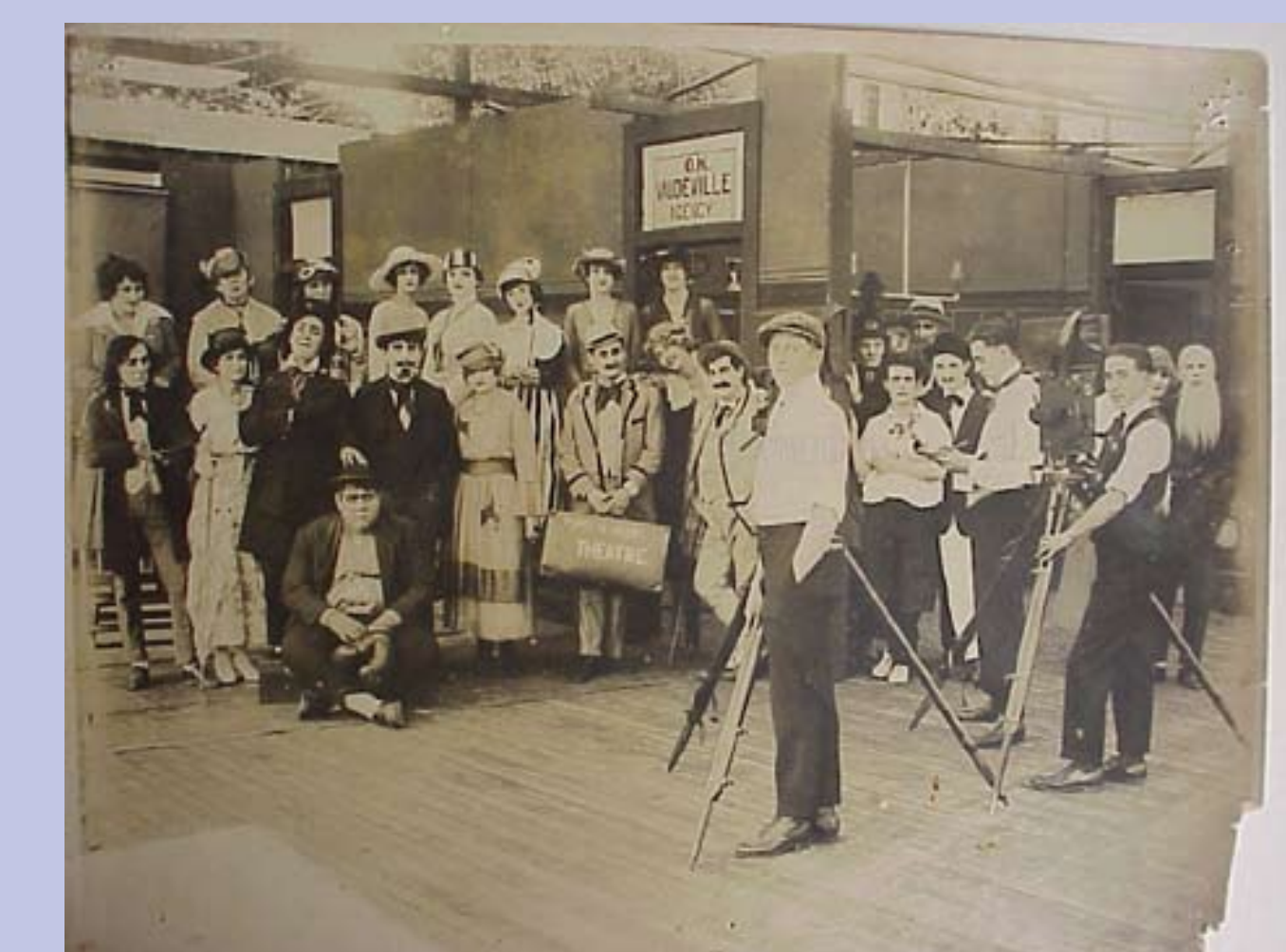
Klutho Studios film crew, ca. 1915 State Library & Archives of Florida

For more historic marker locations, visit www.OldArlington.org